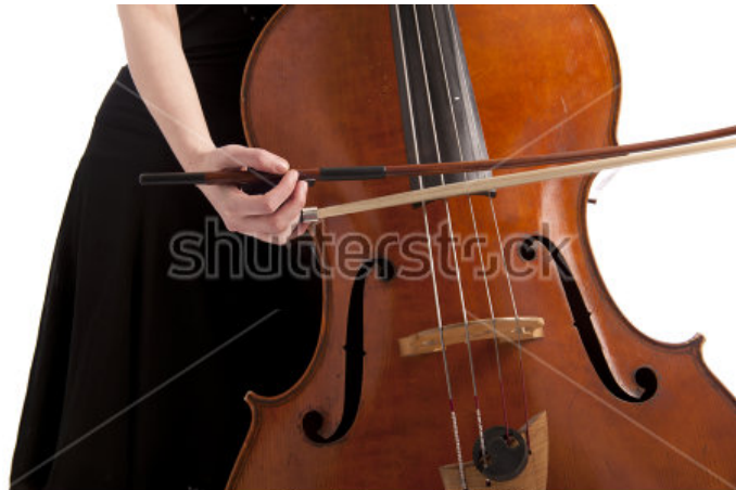
Bass bow hand - German