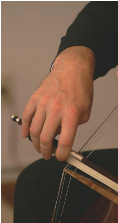
Bass bow hand - French